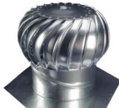
GEB-12 & GT-12 (shown) GALVANIZED STEEL TURBINE

†ADJUSTS TO 7/12 ROOF PITCH AVAILABLE IN MILL ONLY