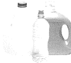
Plastic Bottles & Jugs